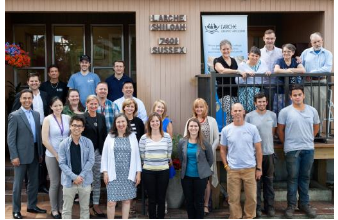
Representatives from the various businesses that assisted in the upgrade project gathered at L'Arche to celebrate its completion, giving people at L'Arche an opportunity to express our gratitude.