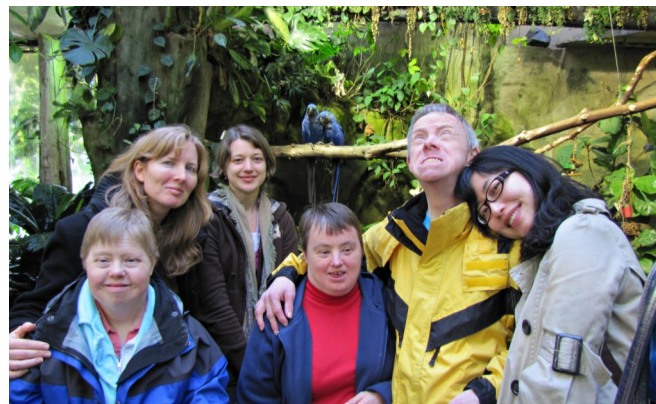
Day trip to the Vancouver Aquarium during Spring Break at L'Arche!

Mr. and Mrs. P.A. Woodward's Foundation Home Depot Canada Foundation Saint Mary's Health Foundation Georgina Foundation