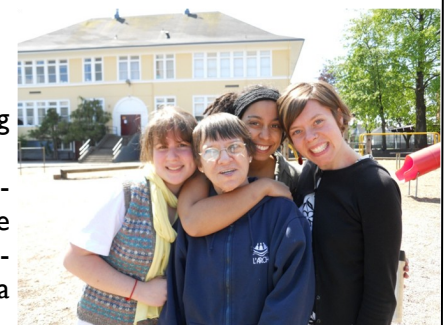
Friendships and growth and L'Arche